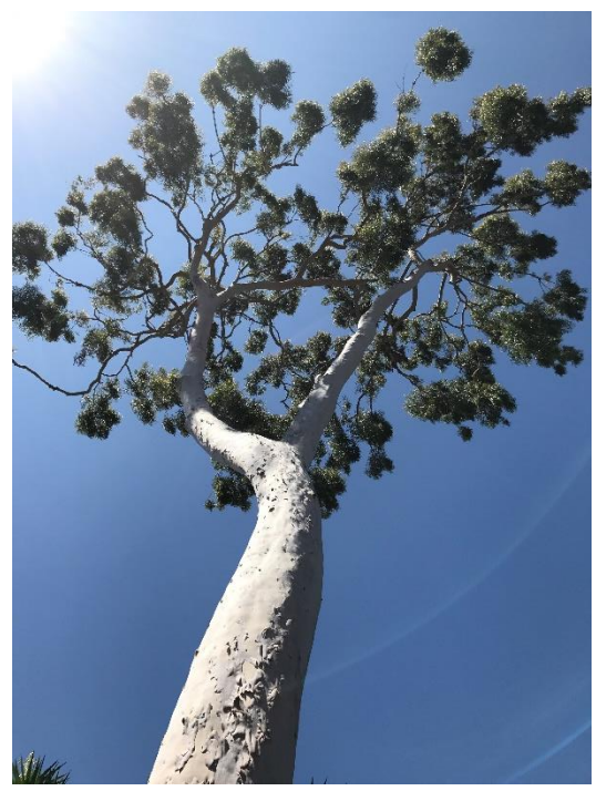
Left: Tillandsia ponderosa majestically perching on Capitan Cook's tea tree (Leptospermum laevigatum). Top: This 50+ year-old massive lemon-sc3ented gum tree (Corymbia citriodora) was planted by Andrew from a 1-gallon container.